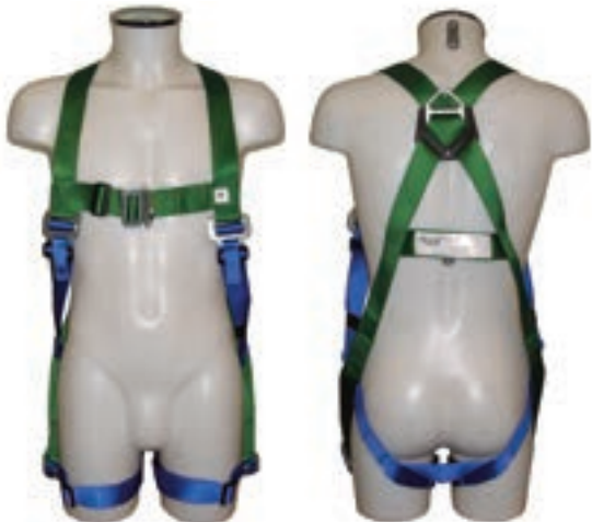
AB20 - Two Point Harness