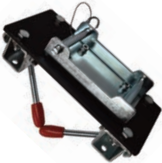
T05T-30 AB30RT to Tripod