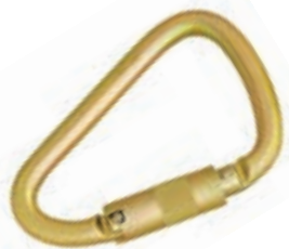
K40SGP - Klettersteig Screwgate