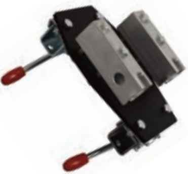
T05TW2 60005 / 60011 / 60257 to Tripod