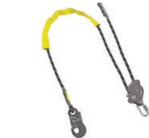
ABRAT - Rope Rat

Adjustable Work Positioning Lanyard c/w Hook and protective cover