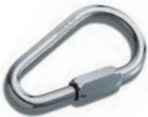
PPEPZ10 - Pear Shaped Maillon