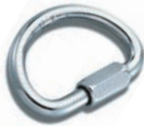
PPESCZ10 - Semi Circular Maillon