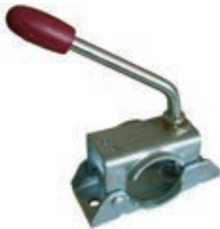
ALKO Tripod Clamp