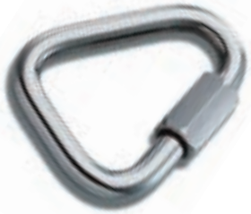
DZ10 - Delta Maillon