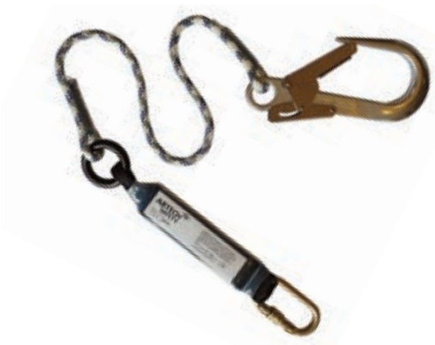
ABSRL1.5SH - 1.5m Fall Arrest Rope Lanyard