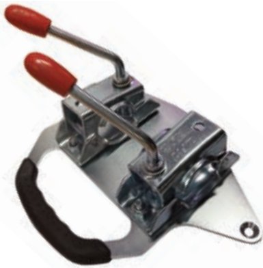
T05T AB15RT to Tripod