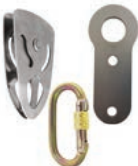
ABDR-KIT Winch Davit Reeve Kit (for use with 60209)