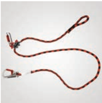
2342 - Work Positioning Lanyard

A work positioning lanyard with a simple one-hand adjustment and is multi certified in different work environments