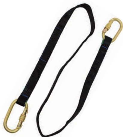
ABRST - Restraint Lanyard

Complete with 2 x K10SG (other lengths and connectors are available to order)