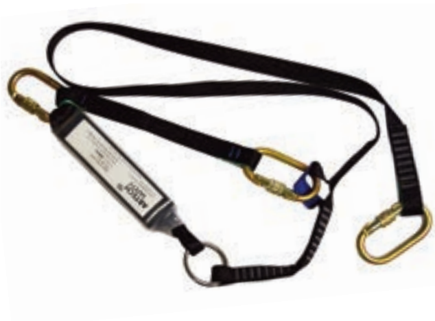
ABLRSST - Combi Lanyard