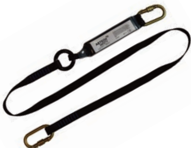
ABL2.0 - 2m Fall Arrest Lanyard