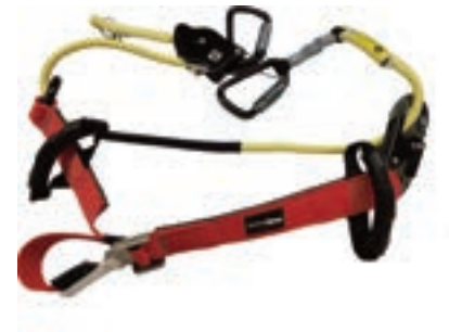
90120POLECAT - Polecat Polechocker

Lightweight pole chocking device for standard and extra stout poles. Easy adjustable it is designed to arrest in a very short distance and minimises the effect in the event of a fall due to the unique mini shock absorber. Side handles for ease of use when climbing