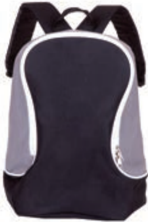
ABBAG - Kit Bag

Kit bag for holding Harness and Lanyard. Zip compartment and padded shoulder straps.