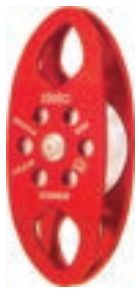
RP034 - Double End Pulley