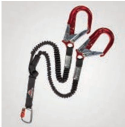
11302 - Twin Fall Arrest Lanyard

Elastic Tails, Aluminium Alloy connectors. Max Length 1.4m