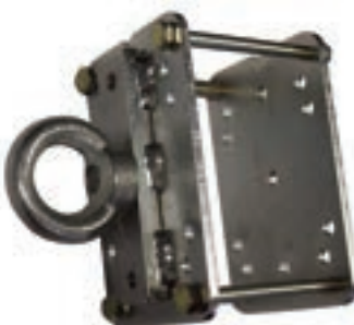
60141/EYE Davit Anchor Eye