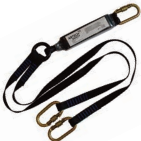
ABLTW1.5 - 1.5m Twin Fall Arrest Lanyard