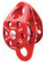
RP030 - Small Double Pulley