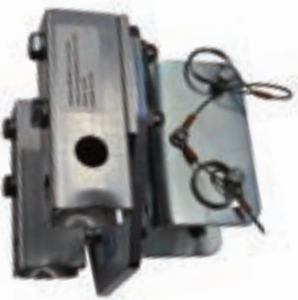
60294 Analog Davit Bracket