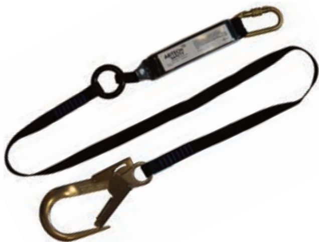
ABL2.0SH - 2m Fall Arrest Lanyard