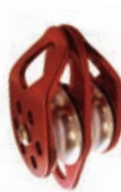
RP033 - Double Pulley