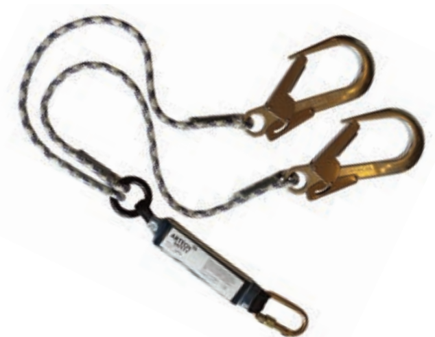
ABTRL1.25SH - 1.25m Twin Fall Arrest Lanyard