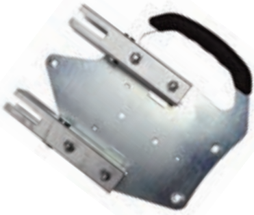
60176/2 AB15RT to Davit (also requires 60209 bracket on the davit)