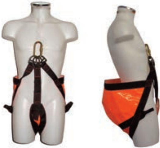
ABNAP - Rescue Nappy

Loops positioned to enable lifting adults or children