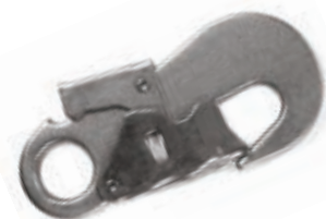
S2046 - Small Snap Hook