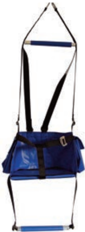
ABBC - Bosuns Chair

For a seated position when in a full body harness