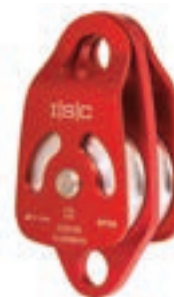
RP700 - Large Double Pulley