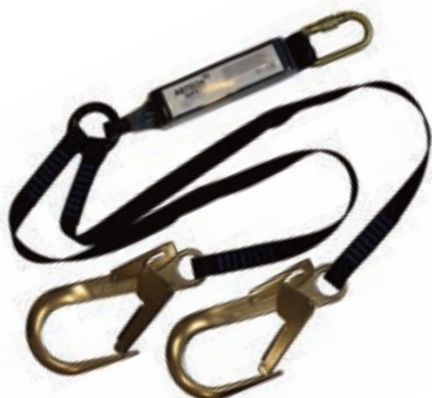
ABLTW1.5SH - 1.5m Twin Fall Arrest Lanyard