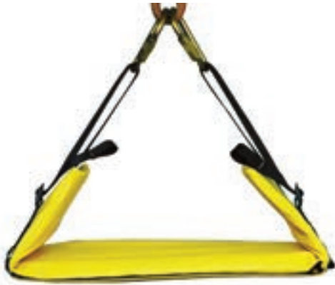
ABBS - Bosuns Seat

For a seated position when in a full body harness with belt and side 'D's