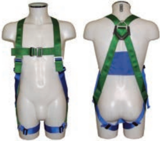
AB10 - Single Point Harness