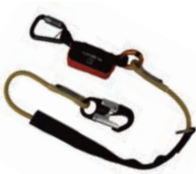
Sirocco Mini shock lanyard

1.95M Cut Resistant Mini Shock Lanyard Shock absorber rated to Fall Factor 2, 140kg. Double action black snap hook – tie back loop