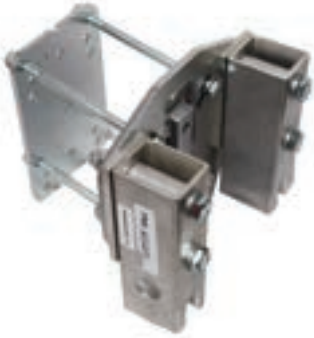
60209 Davit Bracket