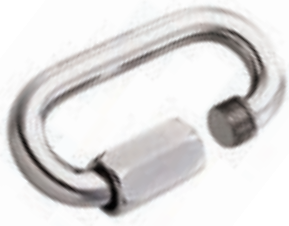
GOZ07 - Oval Maillon