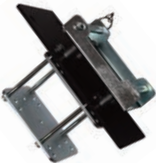
T05T-30D AB30RT to Davit