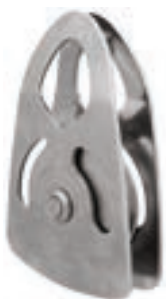
RP066 - Stainless Pulley