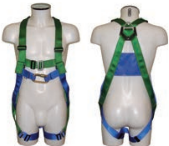
AB20SL - Two Point Harness

Rear 'D' and Chest Soft Loop Attachment Point