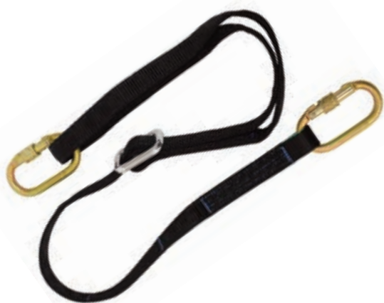
ABRSTADJ - Adjustable Restraint Lanyard